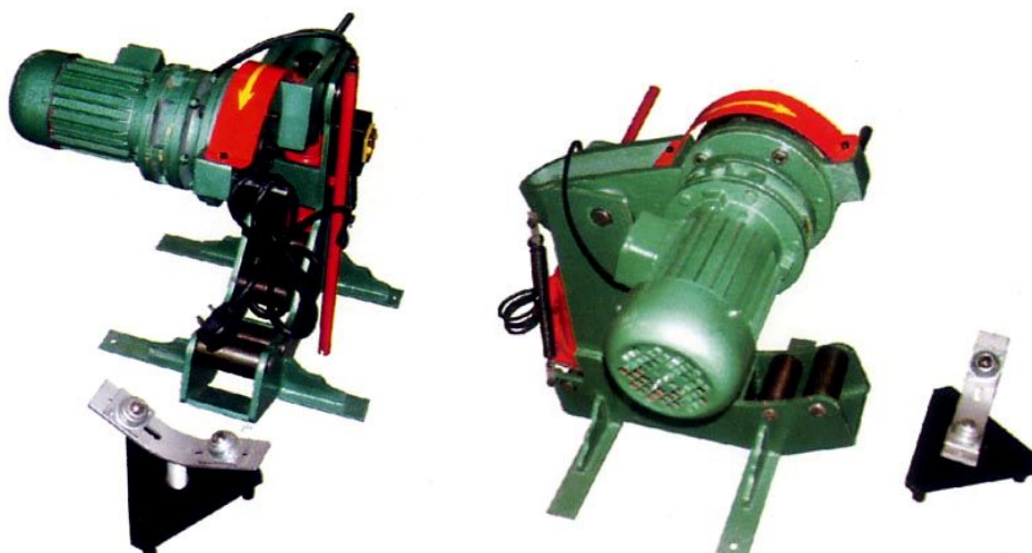
Cutting machine for Metal Pipe