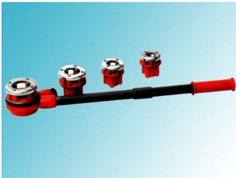
Ratchet die stocks, type62