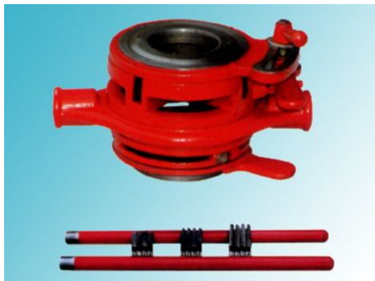
Ratchet die stocks, type114