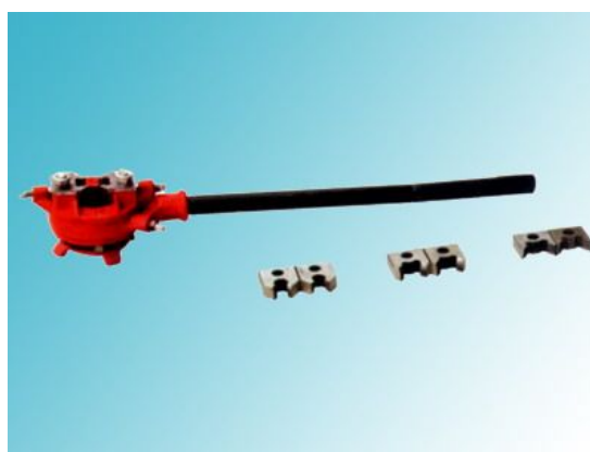
Ratchet die stocks, type112